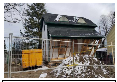
Rose Cottage Penyrn Park (moved to Pine St)