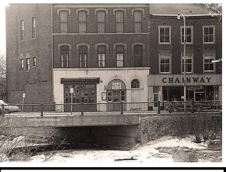
Old Fire Hall (demolished after flood 1980)